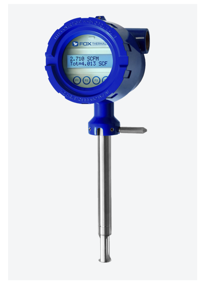
Fox Model FT4A with extensive approvals suitable for industrial uses.