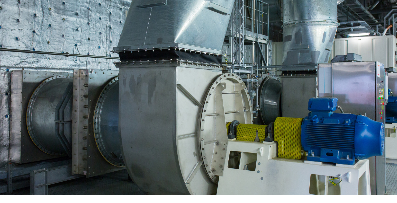
Large fans used for industrial processes.

water cooling systems. To diagnose problems or to conduct system performance assessments, data on air flow within the system must be collected.