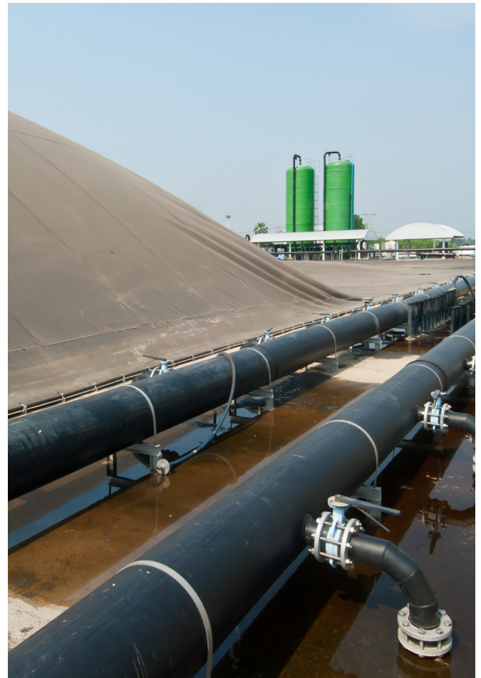
Digester gas collection on site is becoming a popular solution for reducing emissions as more countries move toward net zero emissions.

Farmers are also capturing methane from anaerobic digesters and monetizing the resulting carbon credits through greenhouse gas emissions allowance trading systems. In order to participate in such programs, accurate reports of gas flow must be made. Fox Thermal Flow Meters provide direct measurement of mass flow rate while reducing maintenance costs through its no-moving parts design.