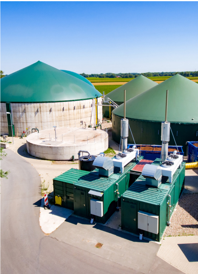
Digester Gas can be used as fuel to power equipment.