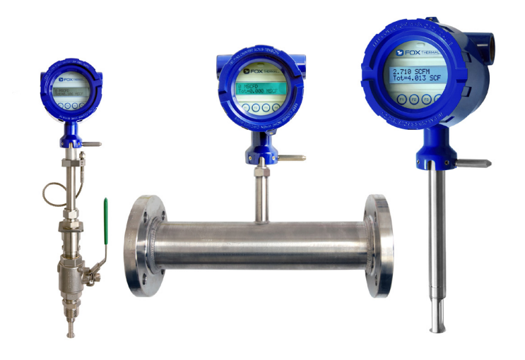
The FT1 is available in insertion, inline, and remote styles. Insertion models can be ordered with retractors and inline flowbodies are manufactured with built-in flow conditioners.

Fox Thermal has certified cleaning and bagging procedures for flow meters to be used in oxygen applications.