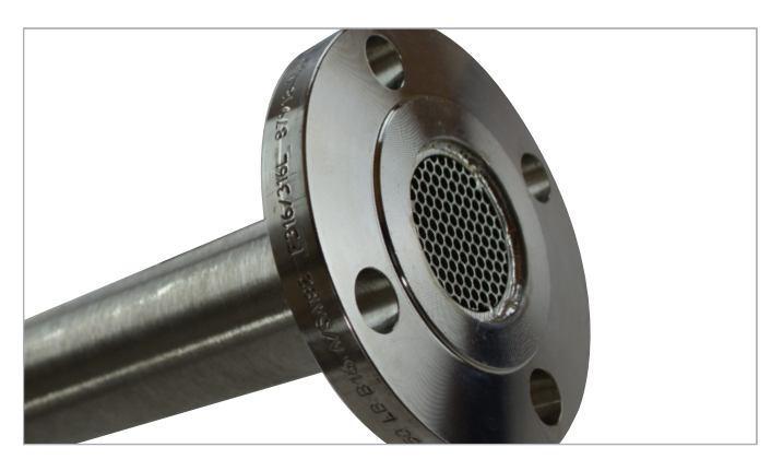
Built-in flow conditioning improves measurement accuracy in spaceconstrained applications.

This feature is of particular value in environmental monitoring applications, such as flares and vents, where periodic calibration validation is mandated. These tests help operators comply with environmental mandates and eliminates the cost and inconvenience of annual factory calibration. It can also be used to streamline quality assurance, improve process initiatives, and apply scheduled maintenance procedures.